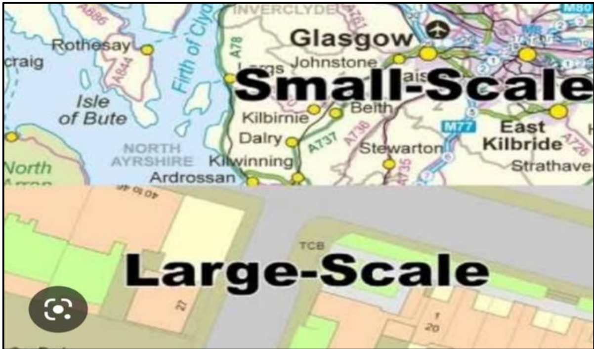
FIGURE 1.2: Small Scale and Large scale map.