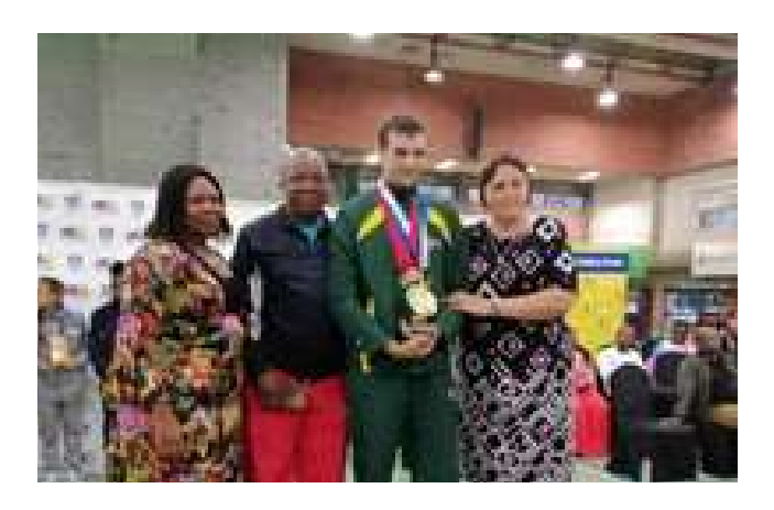
Learners receiving their medals during the National SA-SA-II Games