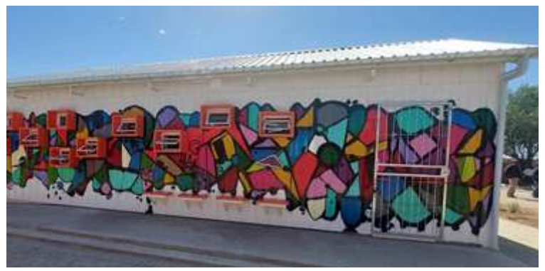
The Science Lab building donated by Minister Blade Nzimande at Realeka Primary School