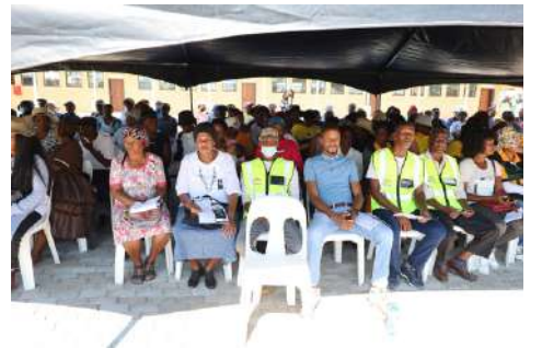
Parents who attended the handover event