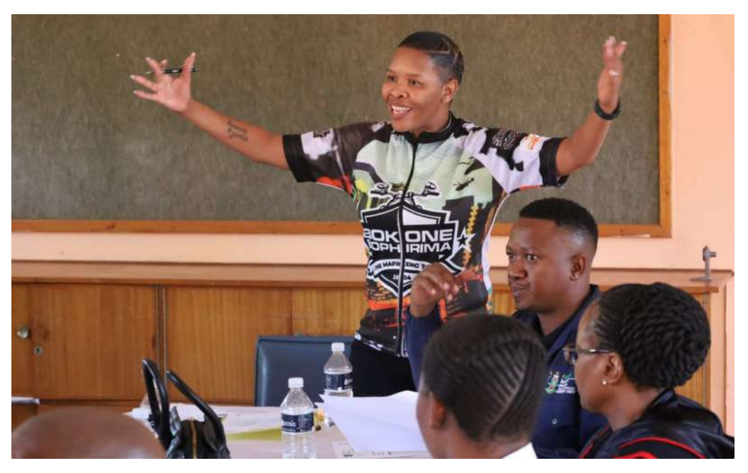
MEC Viola Motsumi addressing the parents who attended the meeting to intoduce the contractor at Gabonewe Secondary School in Madikwe Township

The Mayor for Moses Kotane Local Municipality, Councilor Nketu Nkotswe thanking everyone in attendance and specifically thanked the department for the enthusiasm shown in taking care of an African child. "Indeed it is true the government of the day cares for its people", said Councilor Nkotwe.