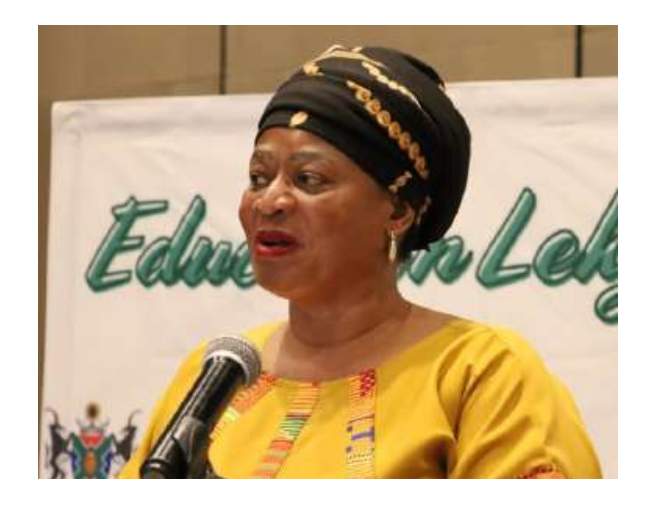
Deputy Minister for DBE, Dr Reginah Mhaule addressing the audience during the Education Lekgotla held in Sun City