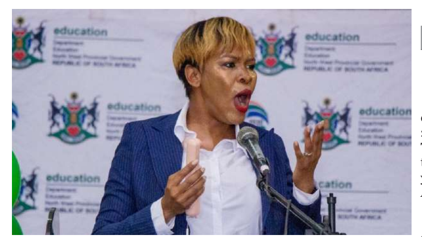
MEC Viola Motsumi addressing the audience during the launch of the SGB Elections held at Victory Primary School