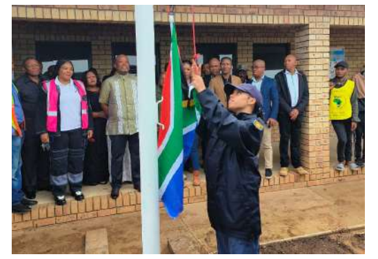
A member of the South African Police Service hoisting the flag during the Saruchera Secondary School handover

Saruchera Primary portrays collective commitment to education and the betterment of our society.