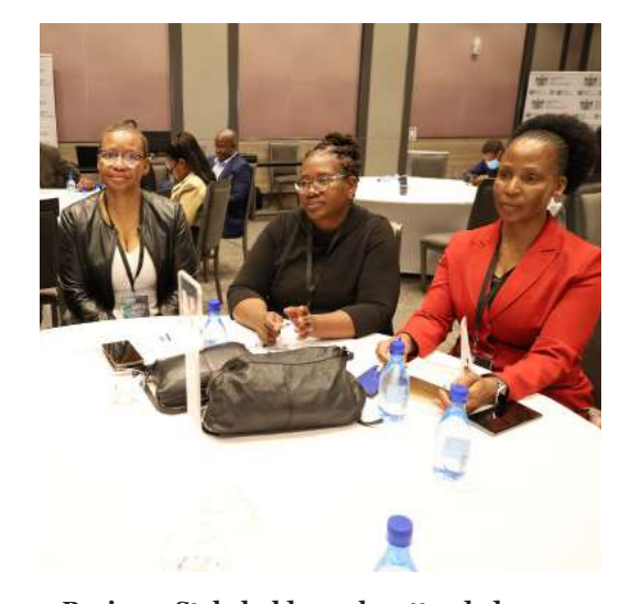
Business Stakeholders who attended the Education Lekgotla at Suncity