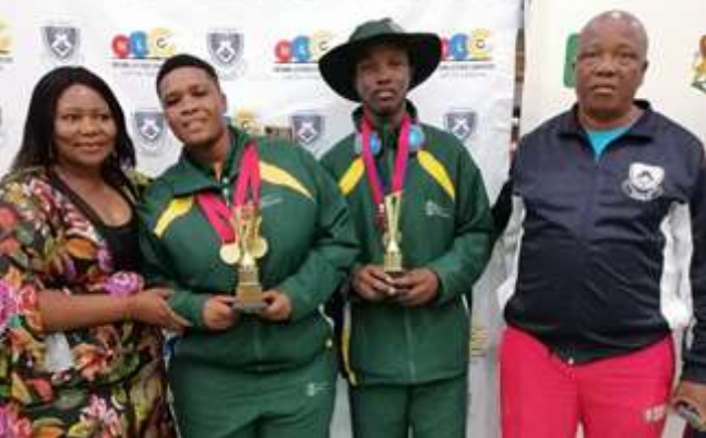
Learners receiving their medals during the National SASA-II Games

The North West Department of Education is proud of the performance that was displayed by the learners and wishes them well in their sporting careers.