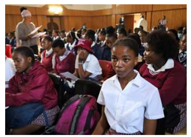
Learners who attended the Career Expo