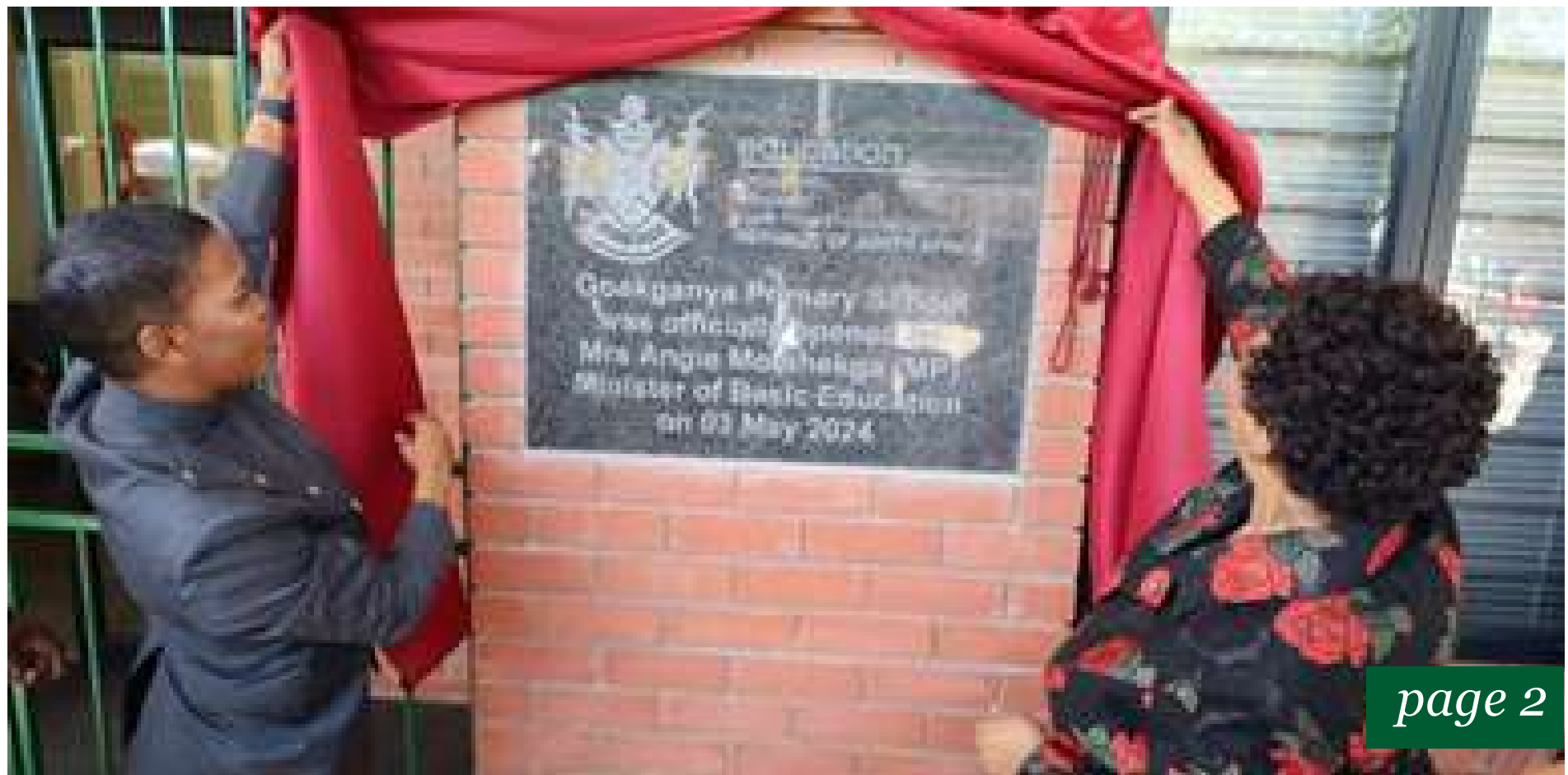
North West Department of Education MEC, Viola Motsumi and Minister of Basic Education, Angie Motshekga at Goakganya Primary School at Phasha-Maloka Village